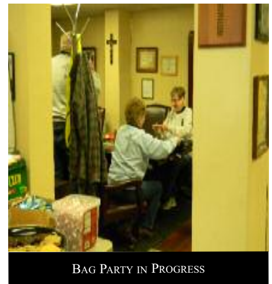
BAG PARTY IN PROGRESS

With every Christmas season, the Urban Missionaries makes new traditions and leans on old favorites to ensure our ministry continues to serve. Read ahead to discover the birth of the Bag Party, and catch a glimpse into the heart of the Christmas Giving Program! Click here to read more directly on our website.